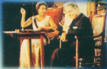
INDEPENDENCE NIGHT 1978

SPECIAL EDITION 25 th Anniversary of Independence